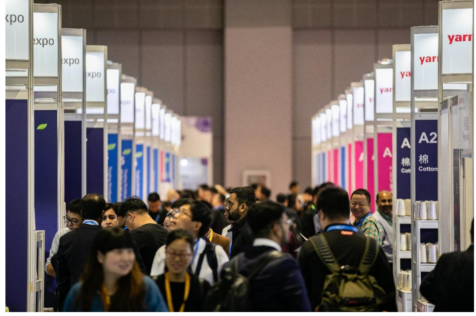
New business potential can be found in every aisle of Yarn Expo

In recent editions of Yarn Expo, new opportunities have been presenting themselves as demand for transparency in the textile supply chain increases. At Yarn Expo Spring 2019, three highlighted exhibitors were selected for in-depth case studies: Birla Cellulose (China), Cotton Council International (USA) and Safilin (France). Each exhibitor gave their opinion on shifting sourcing trends, what needs to be done to achieve sustainability in the textile industry, and how they found entry points into new markets at Yarn Expo.